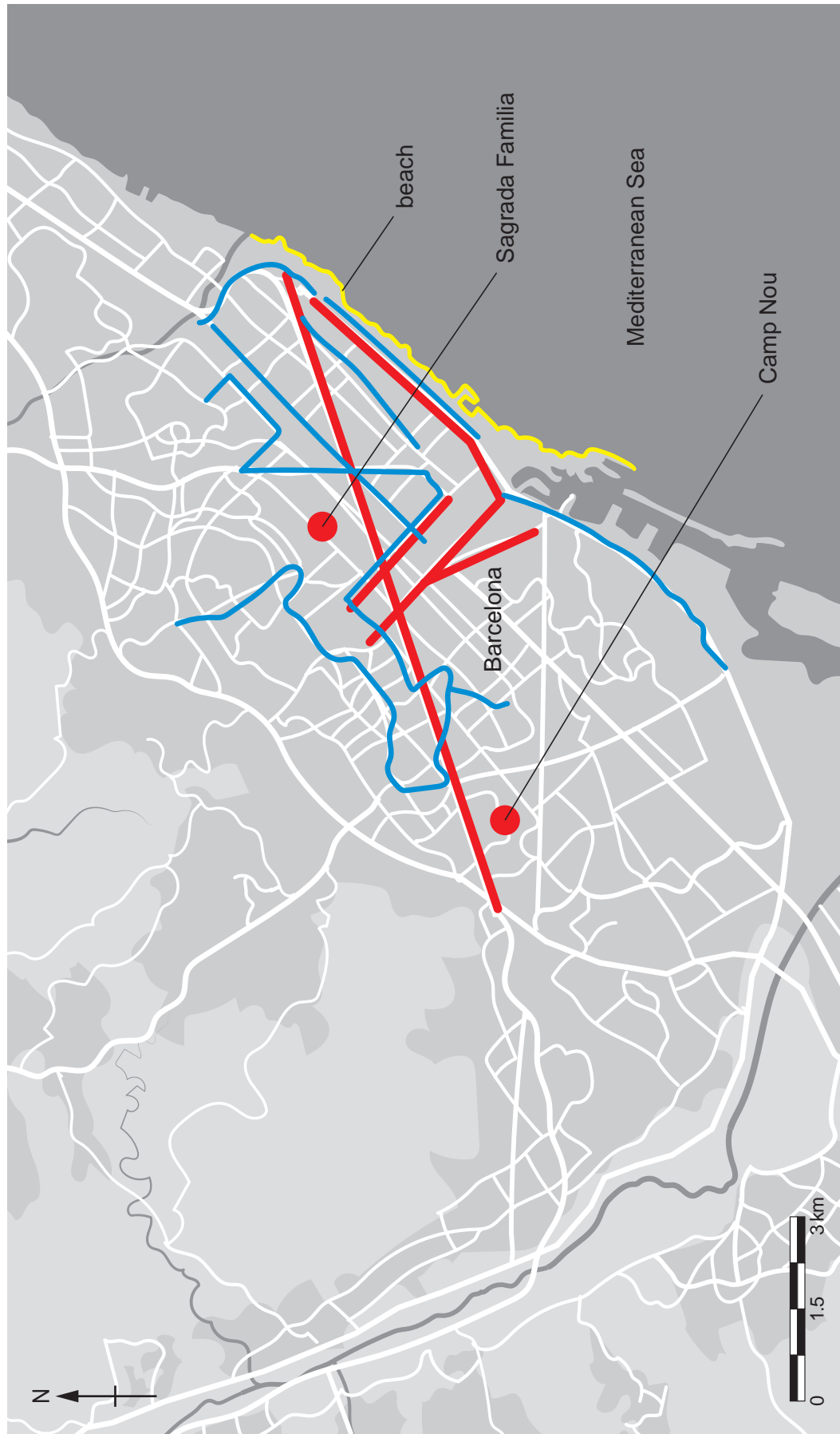
Fig. 5 – Crowd-sourced data of geo-located photographs taken by tourists (in red) and locals (in blue) in Barcelona, Spain

Key: Camp Nou = home of Barcelona Football Club Sagrada Familia = part of a UNESCO World Heritage Site