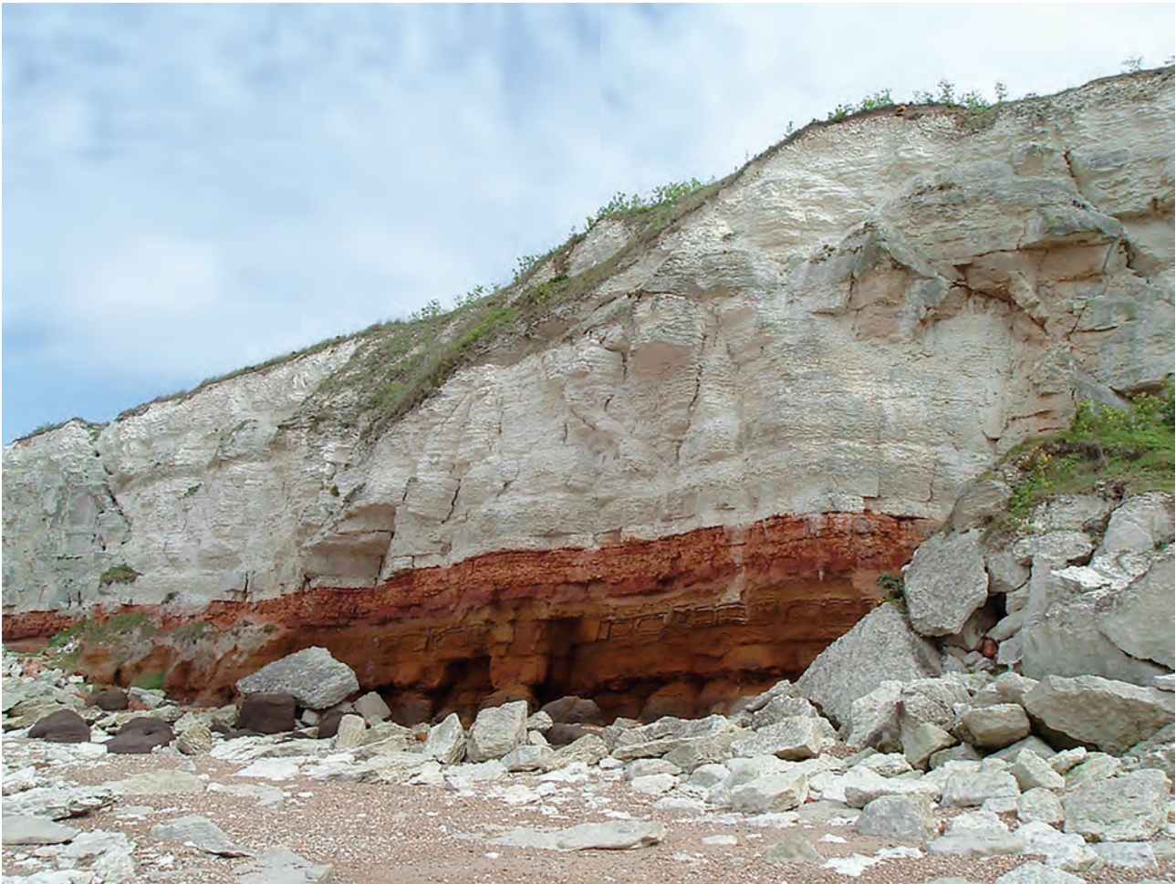
Fig. 1 – A coastal landscape in Norfolk, England